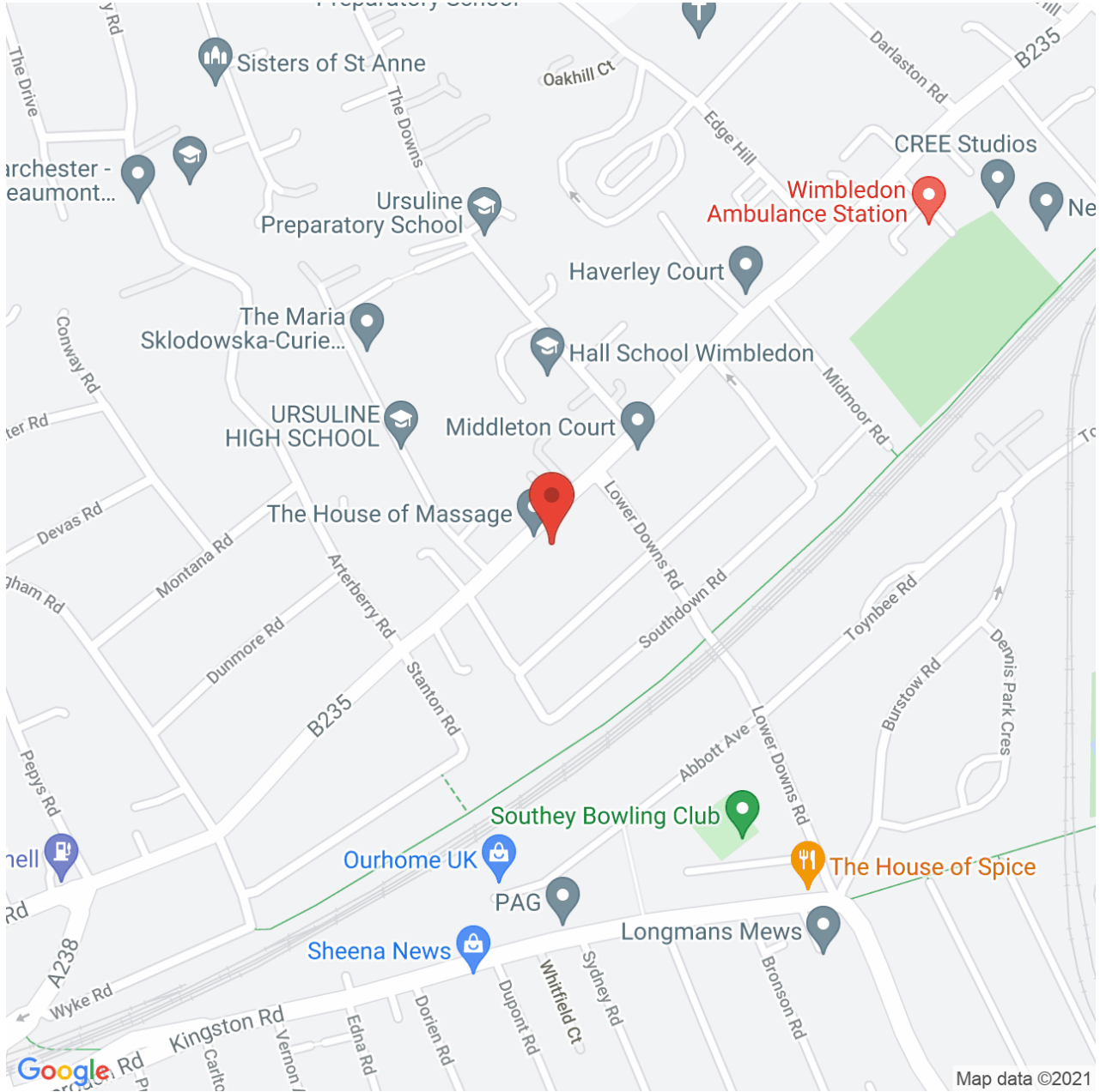
Map supplied by Google Maps. To open map in your browser please click here .