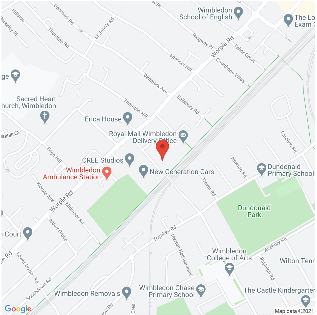
Map supplied by Google Maps. To open map in your browser please click here .