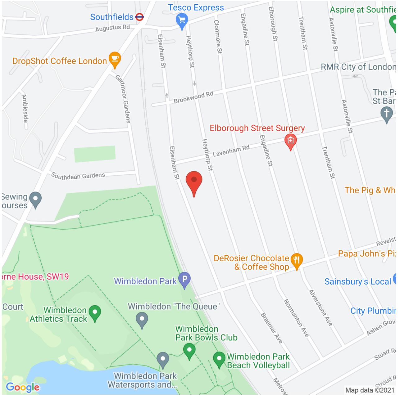
Map supplied by Google Maps. To open map in your browser please click here .