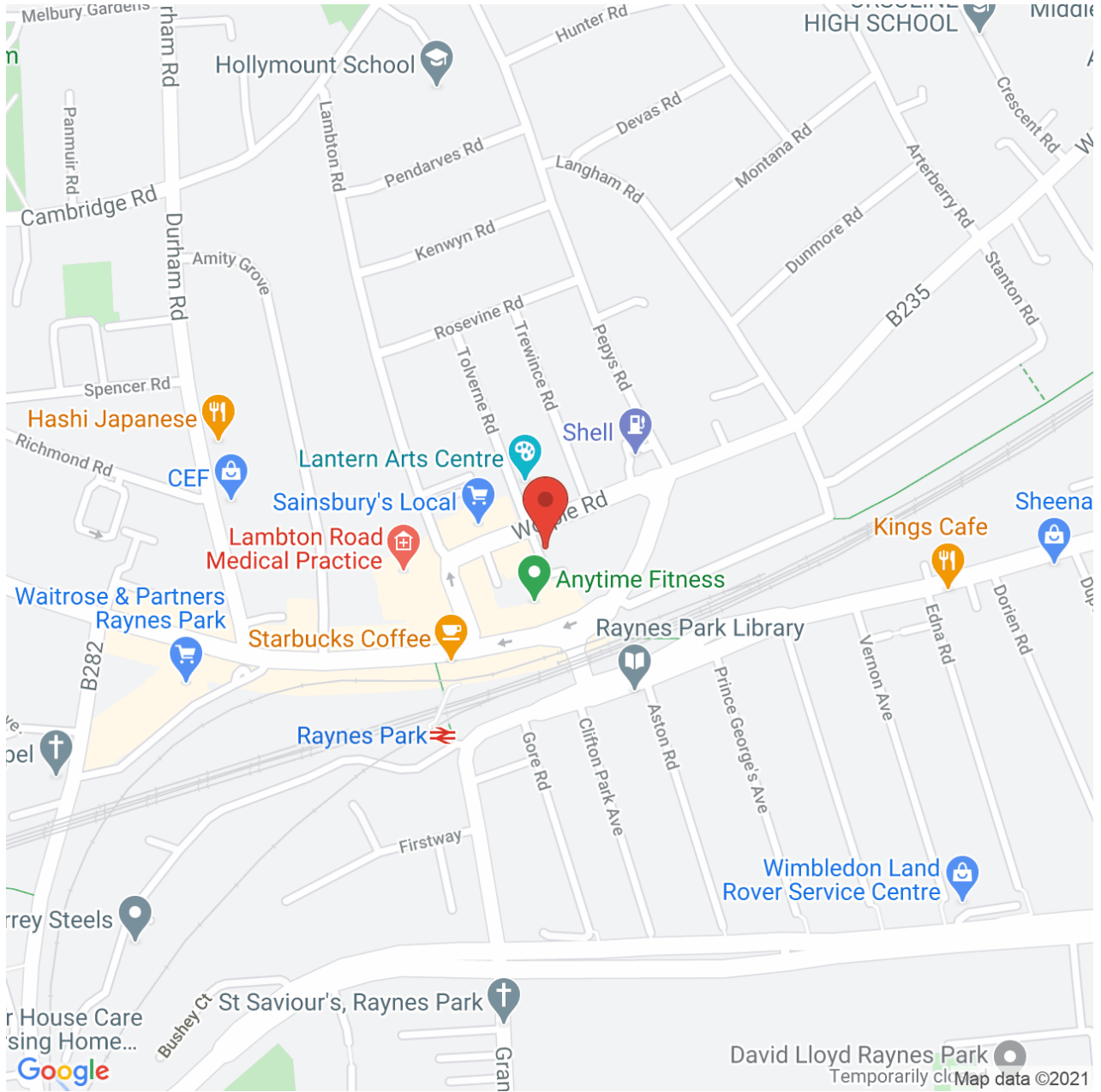
To open map in your browser please click here .