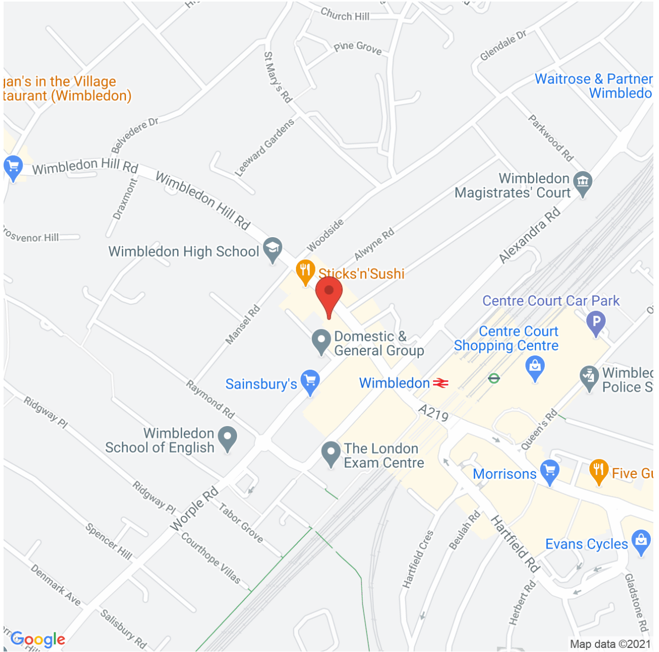
Map supplied by Google Maps. To open map in your browser please click here .