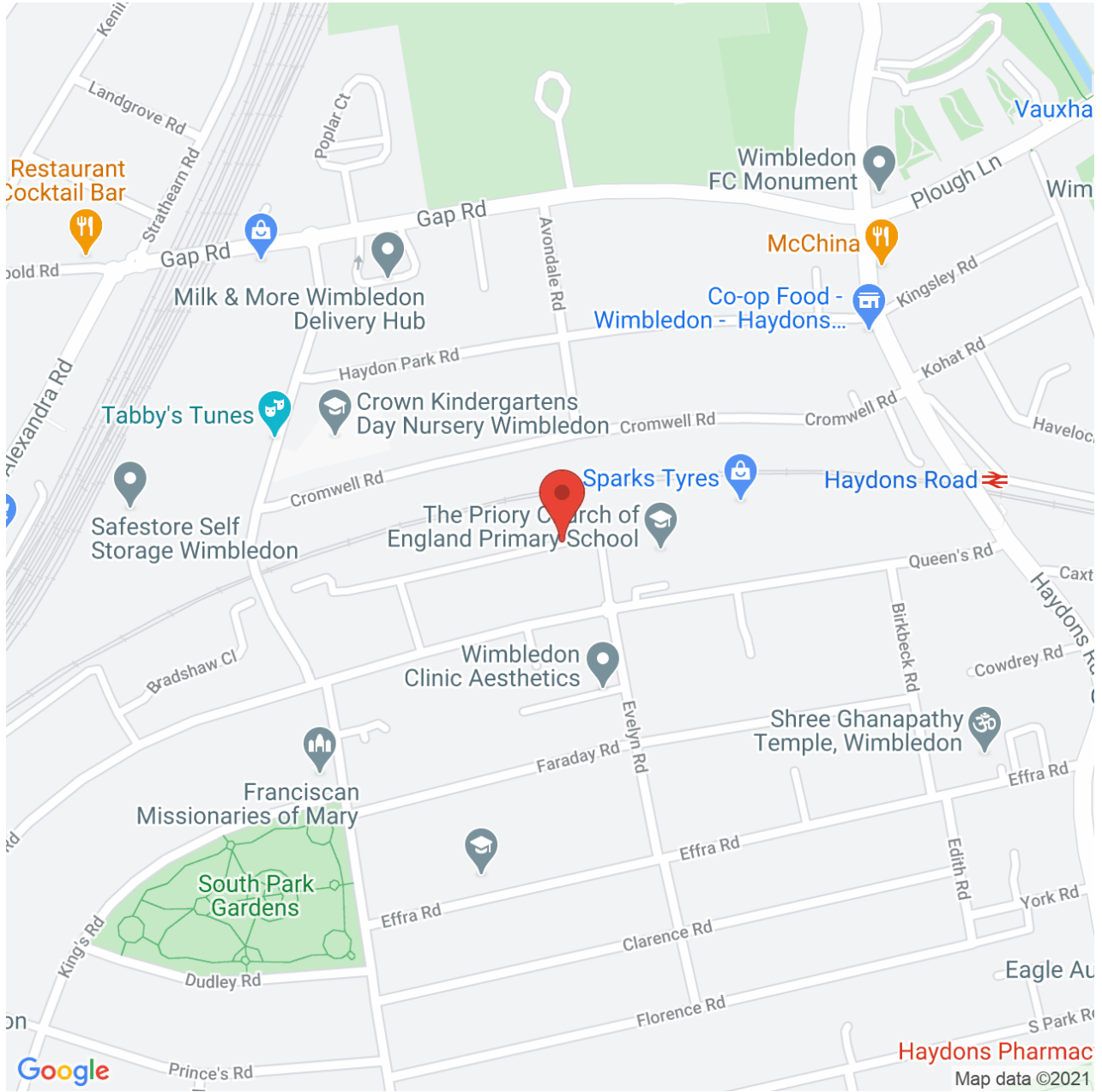
To open map in your browser please click here .