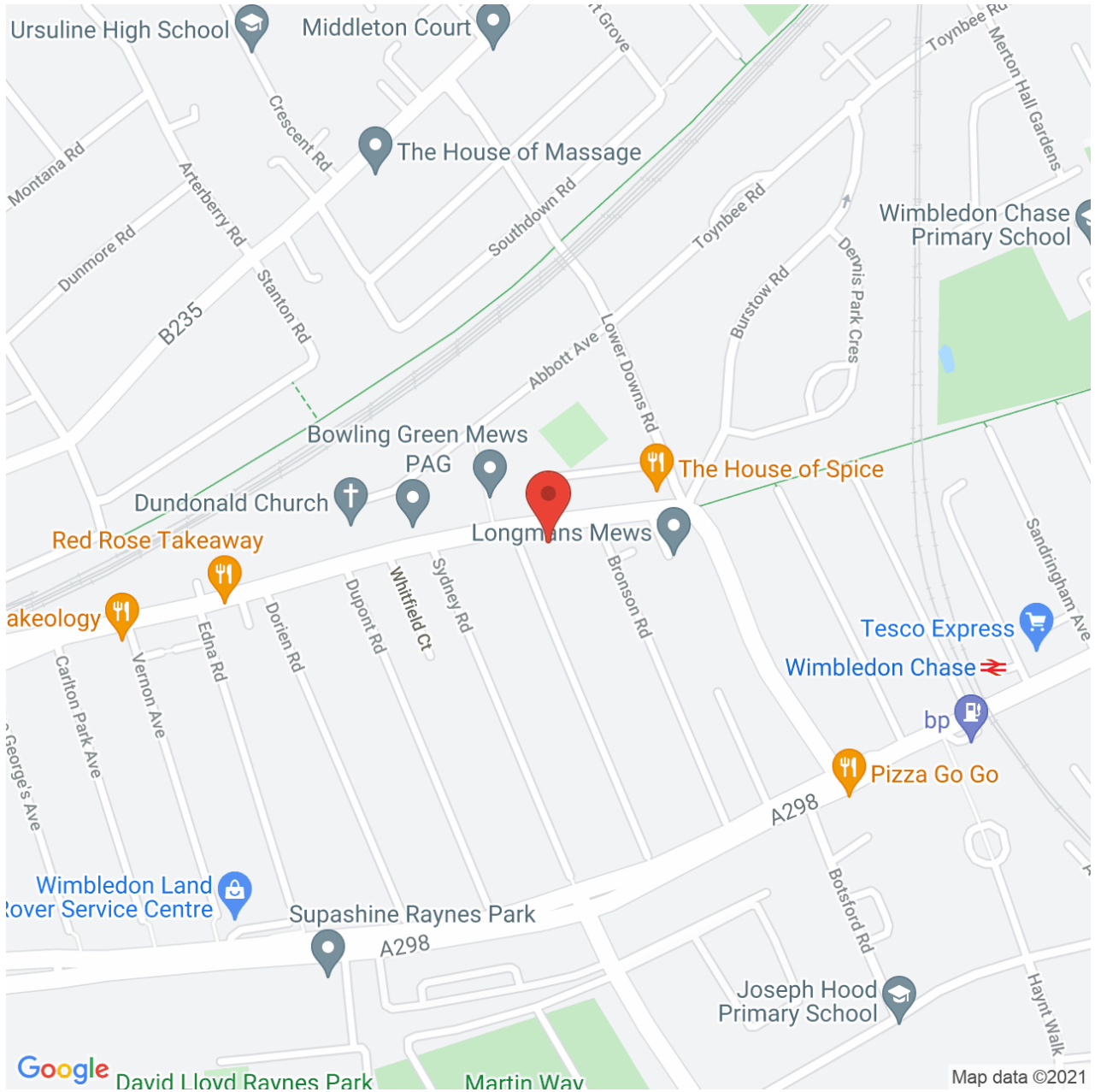
Map supplied by Google Maps. To open map in your browser please click here .