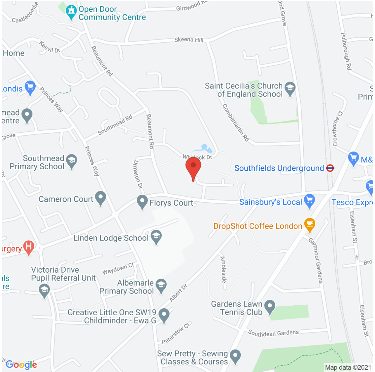
To open map in your browser please click here .