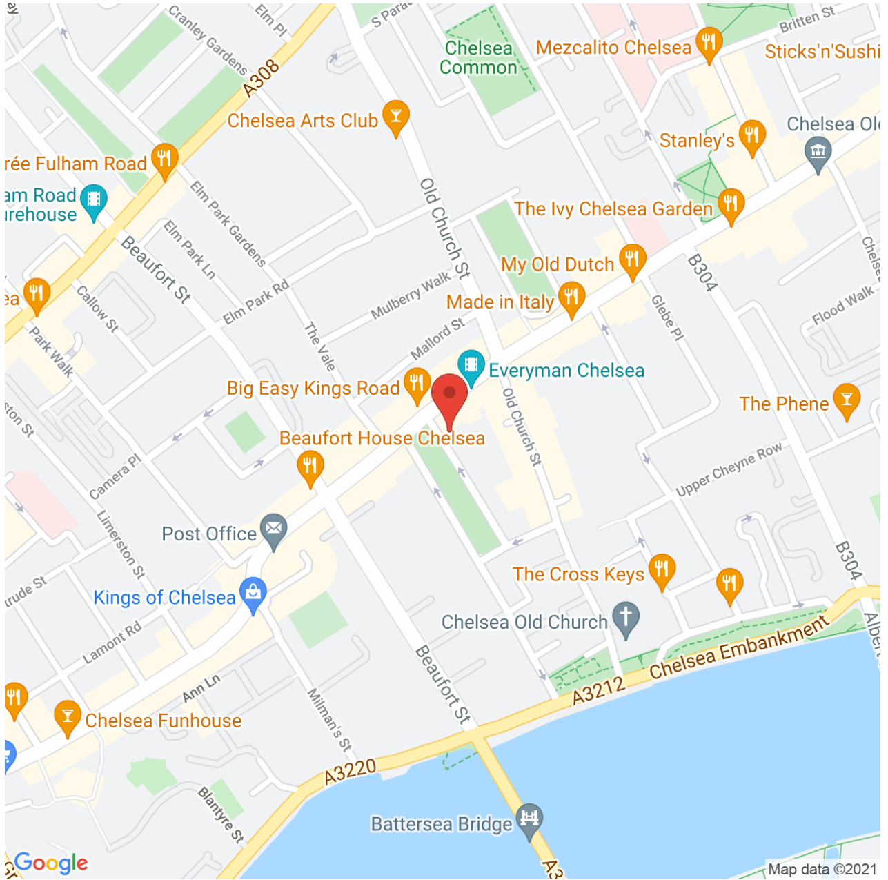
To open map in your browser please click here .